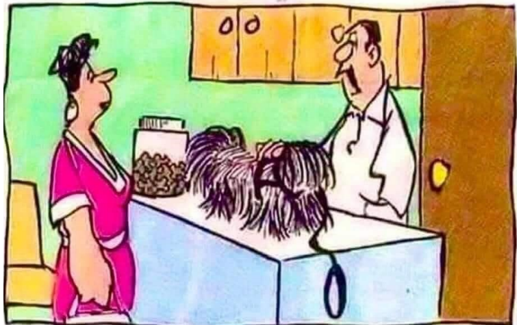
"He's in pretty good shape considering you've been walking him backward."

ADMISSIONS TO PARISH PRIMARY SCHOOLS 2022 Applications for children born between 1 September 2017 and 31 August 2018 can be submitted from the beginning of the 2021 autumn term. The closing date for applications is 15 January 2022. To avoid disappointment please ensure that you read the Admission Policy of all the Parish Schools and have checked the appropriate catchment area. A copy of your child's Baptism Certificate should be included with every application to a Catholic school, regardless of preference.